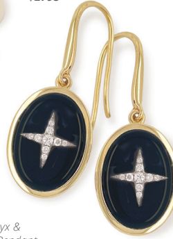
17. 9ct Onyx & Diamond Earrings $2795