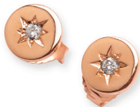
29. 9ct Rose Gold Diamond Set Studs $1695