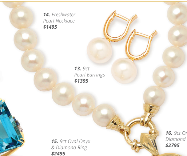
13. 9ct Pearl Earrings $1395