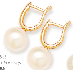
13. 9ct Pearl Earrings $1395