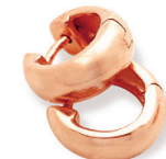
36. 9ct Rose Gold Huggie Earrings $795