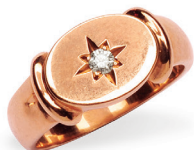
31. 9ct Rose Gold Diamond Oval Signet Ring $1495