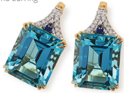
2. Sky Blue Topaz, Blue Sapphire & Diamond Earring $1945