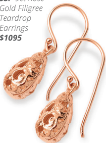
33. 9ct Rose Gold Filigree Teardrop Earrings $1095