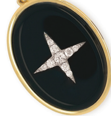
16. 9ct Onyx & Diamond Pendant $2795