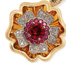
24. 9ct Citrine, Garnet & Pink Sapphire Pendant $1695