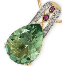
28. Green Amethyst, Rhodolite Garnet & Diamond Pendant $1695