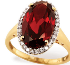
20. 9ct Garnet and Diamond Ring $1695