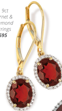
21. 9ct Garnet & Diamond Earrings $1695